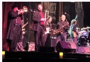
[House band the Empress]